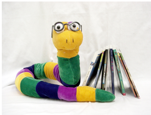
Large & Individual Promotional Items