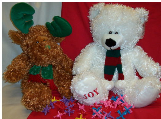
Large & Individual Promotional Items