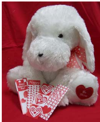
Large & Individual Promotional Items