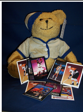
Large & Individual Promotional Items