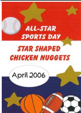
11 x 17 Posters