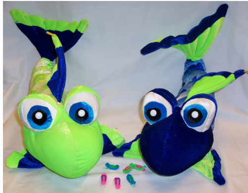
Large & Individual Promotional Items